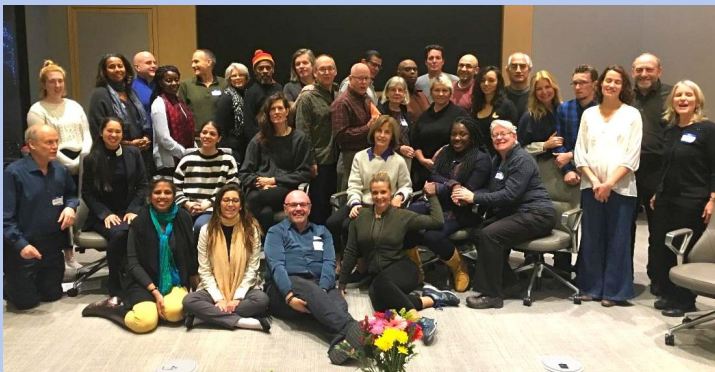
GERI Training for U.N. Gender Activists and ManKind Project Leaders

~ Participant, New York Invitational Training