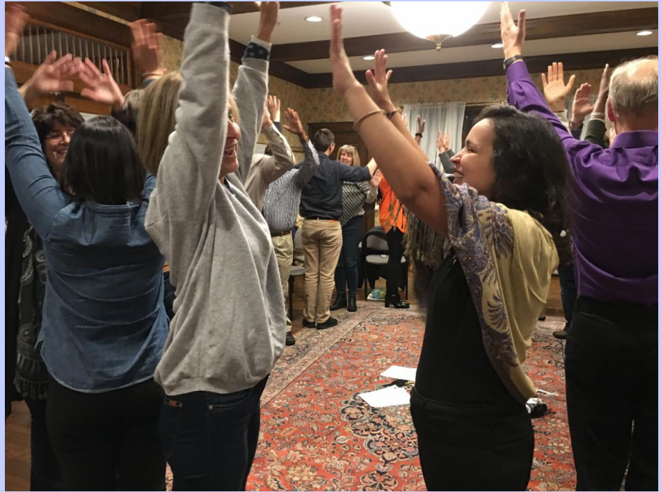
Offering blessings to each other

The men orchestrated the adornment of the women with "Garments of Praise" (Isaiah 61:3), and honored each woman individually. Then each man declared his personal commitment to gender healing and to working to restore the Creator's intended balance and harmony between the sexes. The women invited the men "Back to