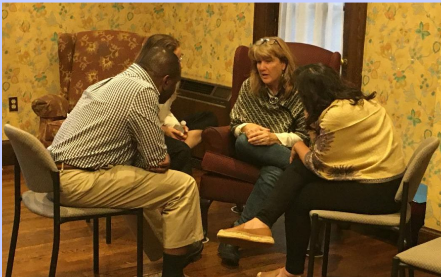
Small Group Sharing

Eden" and made powerful personal commitments towards healing the gender divisions in the human family. This GERI training of 21 inspiring religious leaders created a unique and intimate space of courageous truth telling, shared vulnerability, and prayerful holding and reconciliation.