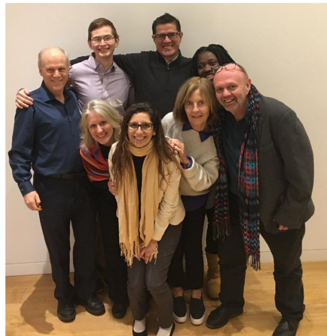
GERI Facilitation Team