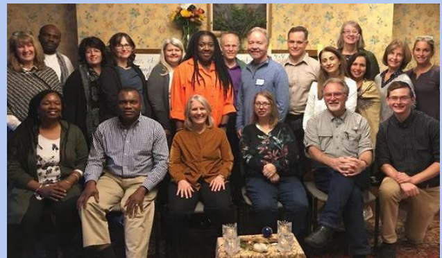
GERI Training for Clergy, Ministers, and Religious Lay Leaders