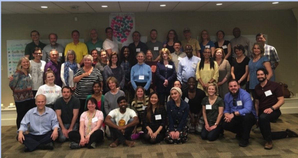
Participants from Boston Workshop ~ #WeHealTogetherNewEngland

"The impact on me intellectually, emotionally and spiritually were quite profound. To call my experience transformational is not overstated ... I experienced a significant paradigm shift, and left with my humility deeply reaffirmed. More importantly, I left with a deep and passionate commitment to play an active role in bridging the divide between women and men to effect immediate and long term change."