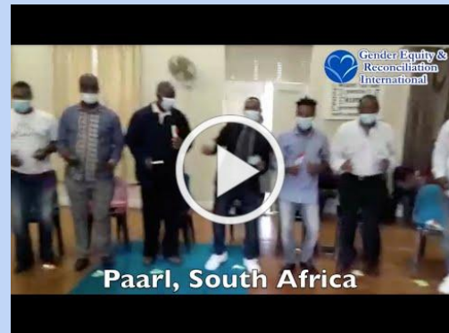
Honoring ceremony from recent workshop near Cape Town, South Africa.

It is a great joy to share with you recent highlights from Gender Equity and Reconciliation International (GERI). As diversity and inclusion is becoming ever more important today, GERI is more relevant than ever—balancing our decades of experience with our dynamic new leadership team, plus new initiatives that build on the application of GERI for the BIPOC and LGBTQIA+ communities, and Latin America.